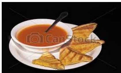
© Can Stock Photo - csp1154827