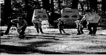
Fall 2019 Groundbreaking

Luther Park is growing into the future, reaching more lives in faith... join us in this legacy!