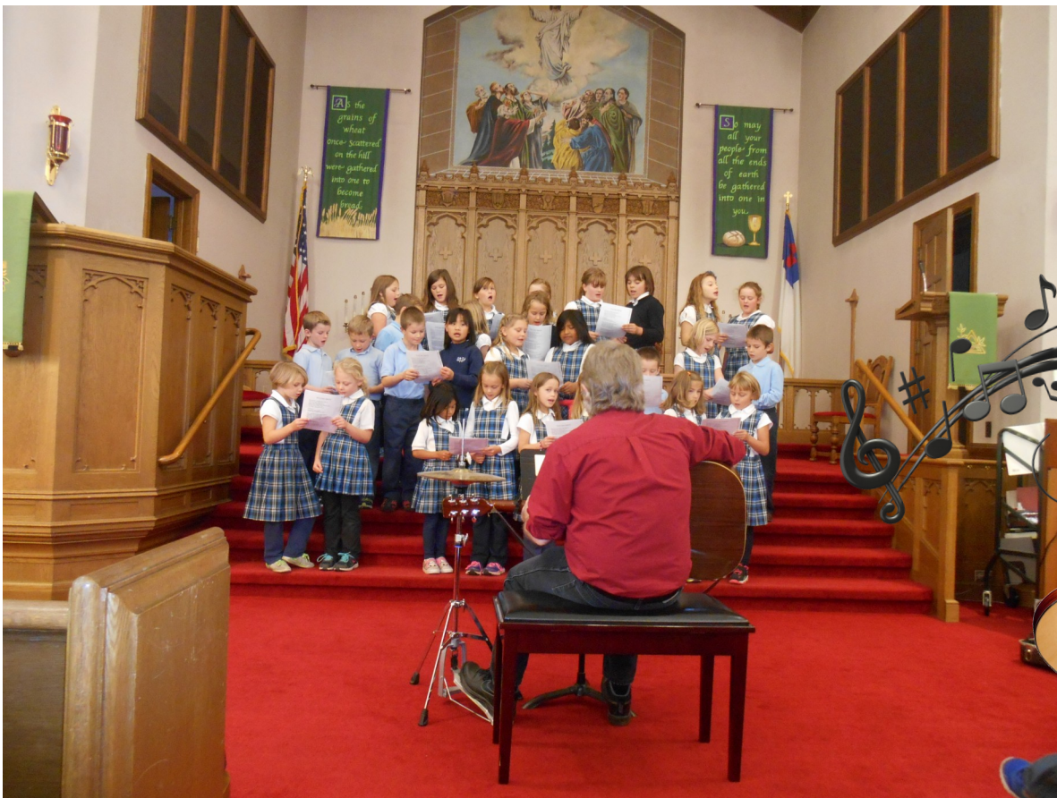
St. Paul's Catholic School made a visit to St. John's Church. They sang to St. John's Preschool kids!