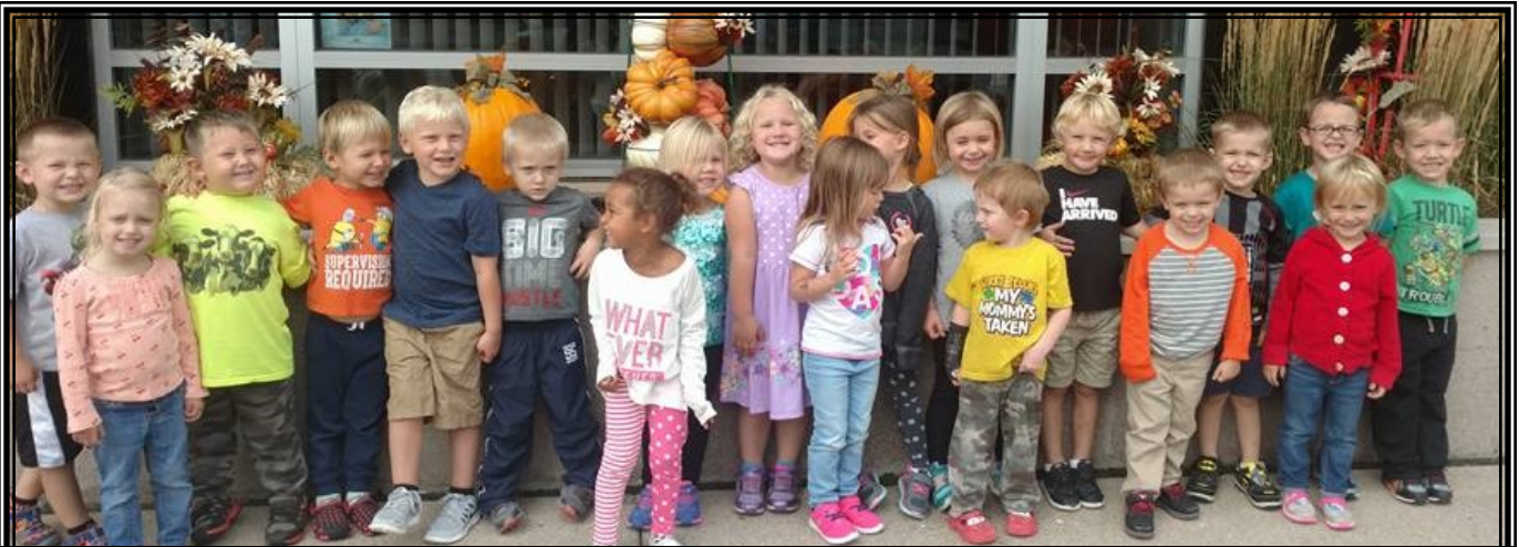
Above picture: M-W-F class Below picture: Tues & Thurs class