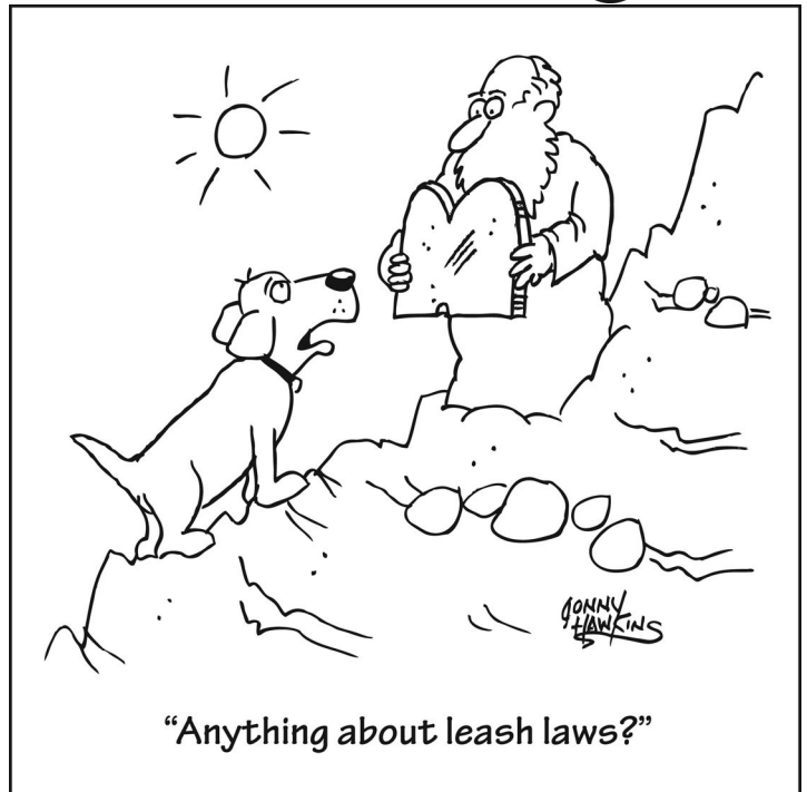
"Anything about leash laws?"