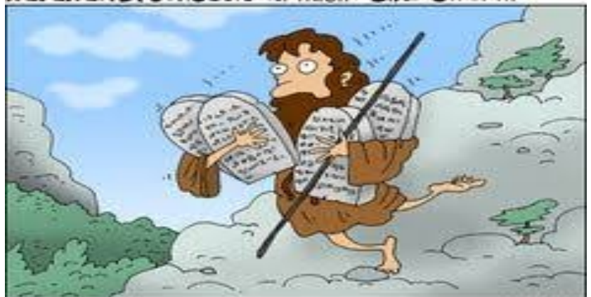
(See Exodus 31) (02-13-2012) MOSES RETURNS DOWN THE MOUNTAIN WITH THE TWENTY COMMANDMENTS